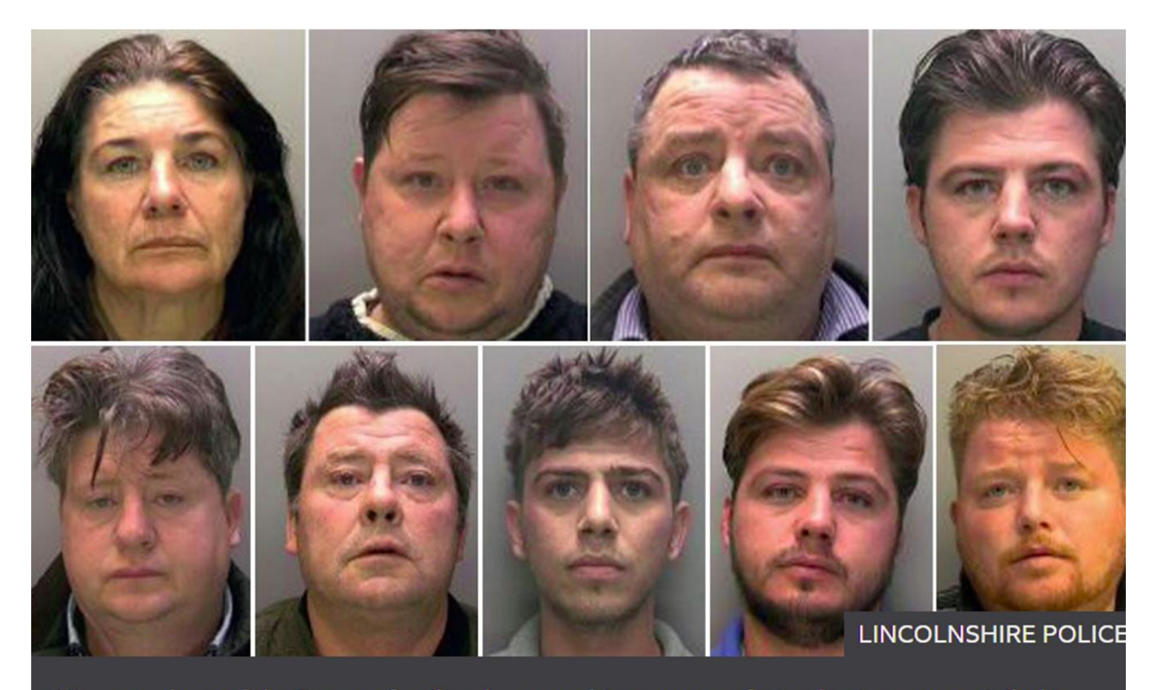
Nine members of the Rooney family, who ran a driveway resurfacing business, were jailed in 2017